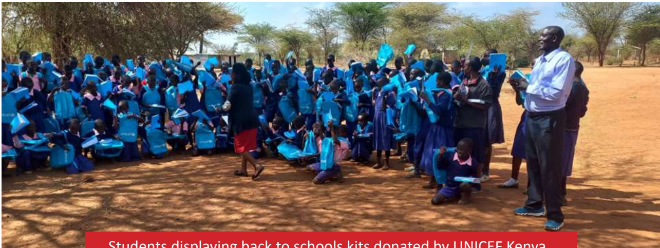
Students displaying back to schools kits donated by UNICEF Kenya