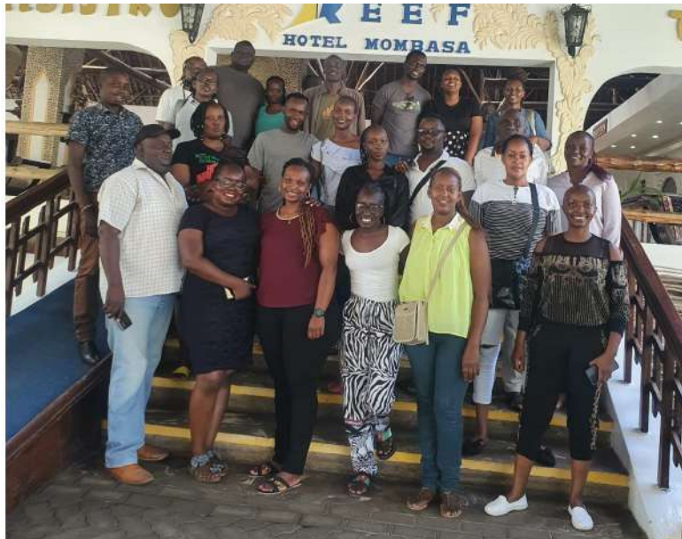
A group photo of the assessors during the training at Reef Hotel, Mombasa

WERK conducted an impact evaluation of Aga Khan Foundation's (AKF) Tucheze Kujifunza (TuKu) on behalf of Research Triangle Institute (RTI). The purpose of the research activity was to generate evidence on scaling learning through play and conduct: an impact evaluation of the program. The midline survey was conducted in the coastal regions of Lamu, Kilifi and Mombasa counties.